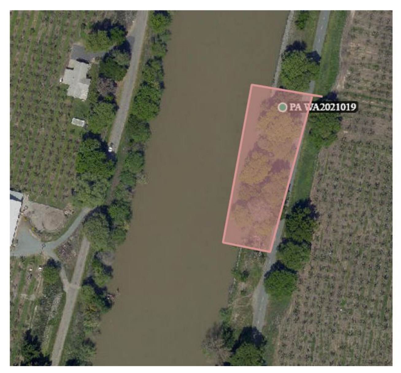
3) Proposed project footprint map